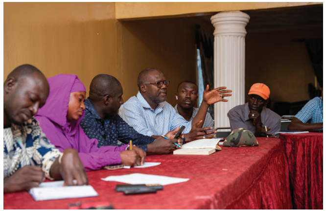
Members of the Technical Advisory Committee at the regional consultation in the West Coast Region of the Gambia